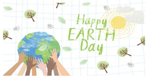
April 22: Earth Day

Join us in the cafeteria on April 22 as we celebrate Earth Day!